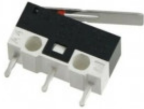
Mini Micro Limit Switch Ultra Small 1A